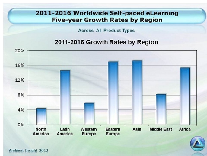
Figure 1 Growth Rates for 2011-2016 Global Macro-regions

The European Union in 2011, was the second largest market for e-learning, has a growth rate of 5.8% per annum, which leads from 6.1 billion dollars in 2011 to the expected 8.1 billion dollars of 2016. There are approximately 3 million students enrolled in online courses, half of whom were enrolled in Distance Teaching University and Open University, while the other half at traditional universities that offer distance learning courses.